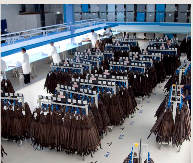
Offering Last decade: 3,411