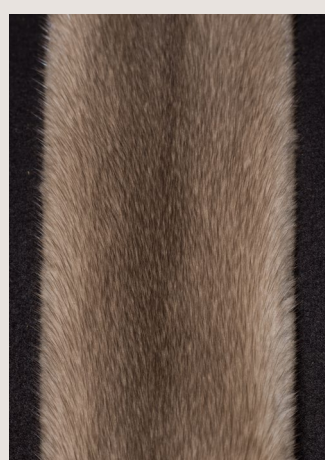
Offering Last decade: 25,540 Future: