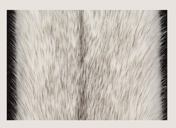
Offering Last decade: 2,356

The basic type of cross mink is black and white. If recessive colour types are combined with Black Cross, the colour of the cross pattern is determined by the recessive colour type. Therefore, Cross mink comes in a variaty of different colours from dark to light with Blue Iris coloured guard hair.