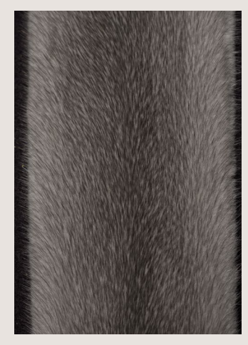
Offering Last decade: