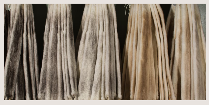
Offering Last decade: 2,024