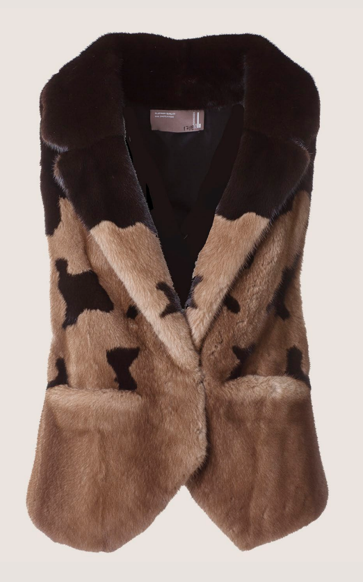
Short description: Lighter than Pastel.