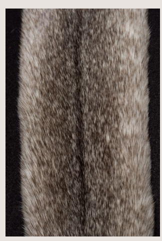
Offering Last decade: 214,271