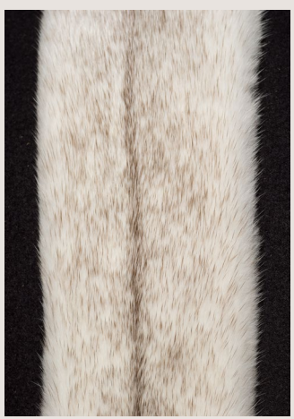
Offering Last decade: 22,187