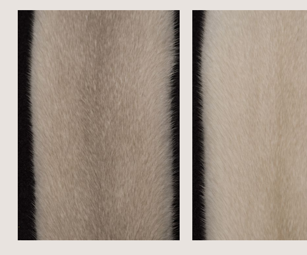
Offering Last decade: